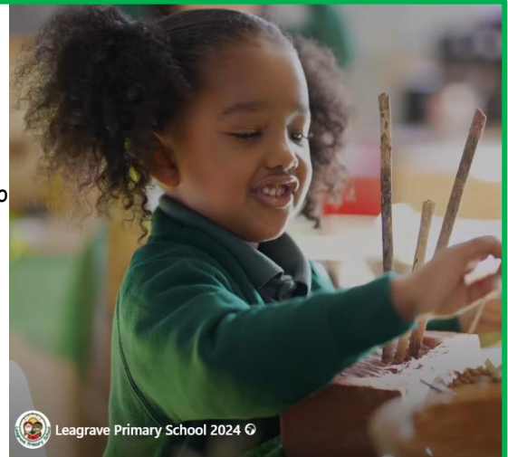
Leagrave Primary School 2024

Enrolment for new spaces is now open and interested families are encouraged to contact the admission team on 01582 509531.